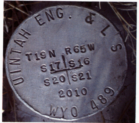
FOUND: ALUMINUM CAP, PLS 489